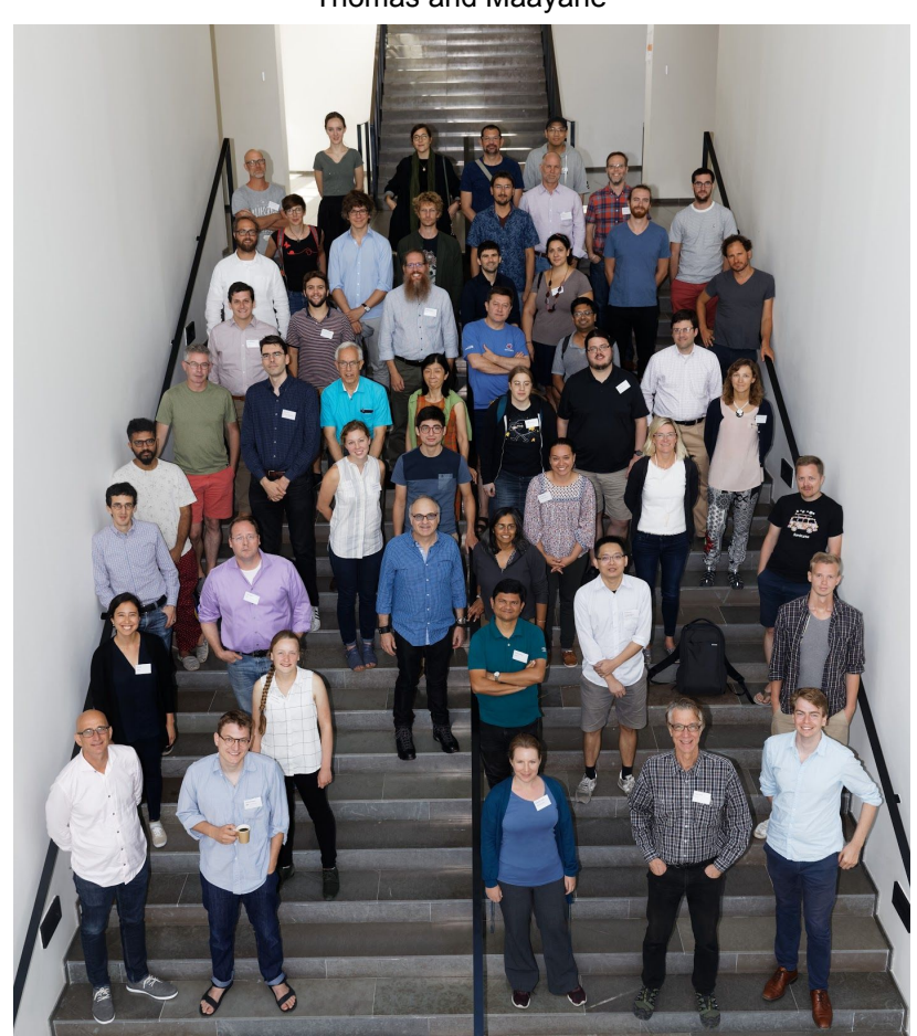
Collaboration picture in Stockholm