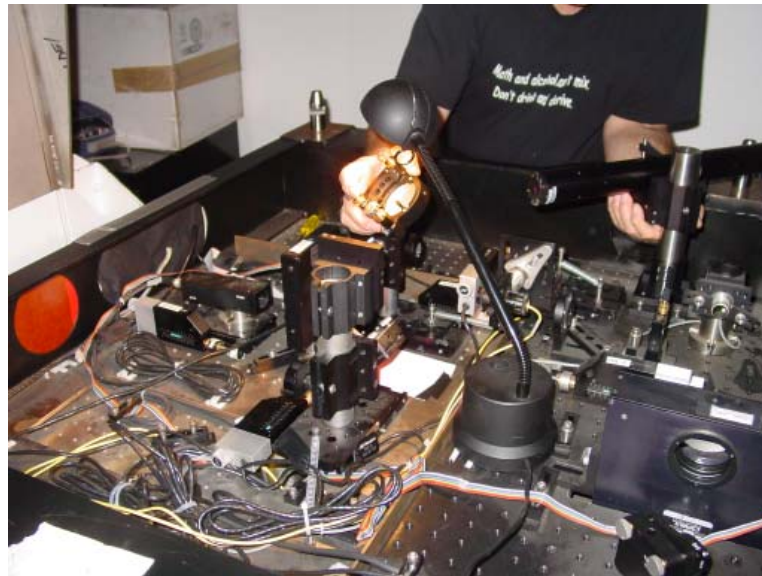
Figure 1: Setting up of the HeNe laser in the PALAO STIMULUS unit