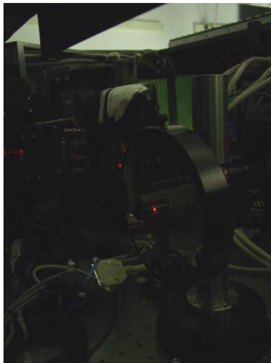
Figure 3: The laser beam on one of the PALAO optical elements represents the optical axis of the system